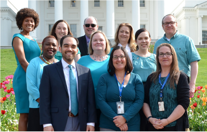
DCJS staff gather on the Capitol steps to honor Sexual Assault Awareness Month.

In honor of Sexual Assault Awareness Month (SAAM) in April, 2019, DCJS planned several activities. As teal is the ribbon color designated to represent SAAM, on April 18, 2019, DCJS coordinated "Teal Thursday." DCJS asked other state agencies and victim services organizations statewide to wear teal in honor of SAAM. Across the Commonwealth, agencies showed support for those whose lives have been impacted by sexual violence by wearing teal. A slide show of Teal Thursday photos is available on the DCJS Facebook page at: www.facebook.com/vadcjs/videos/1430112713798334/